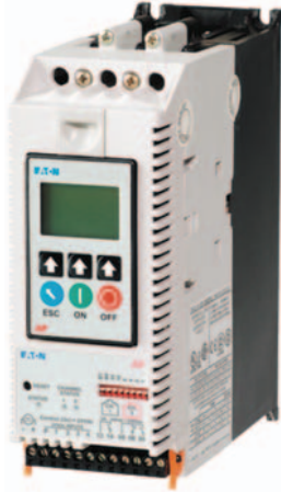
Type S811, Soft Starters with DIM